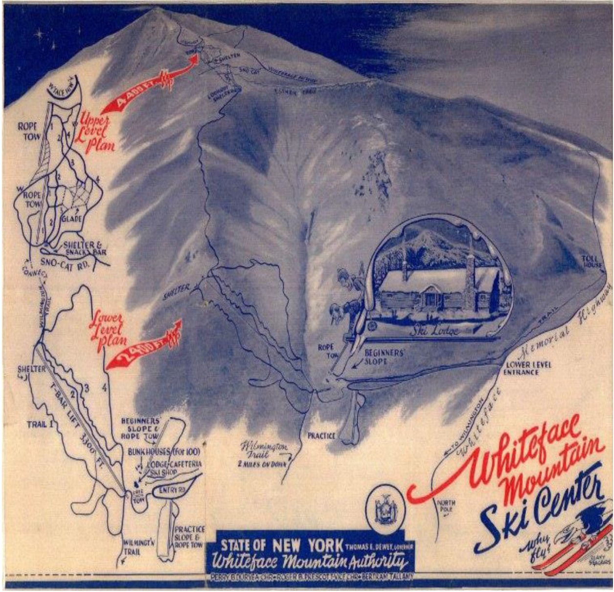
Exhibit 1: State of New York Whiteface Mountain Authority Graphical Map